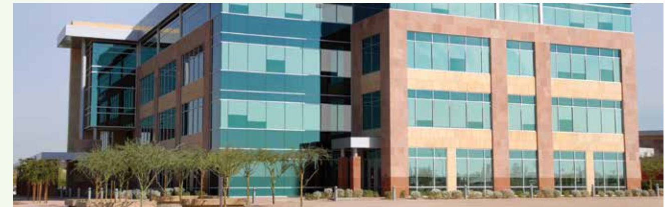
White backing to streetside

Coordinate shade fabric colors with spandrel and vision glass, along with other exterior building materials, to create sleek, streamlined buildings.