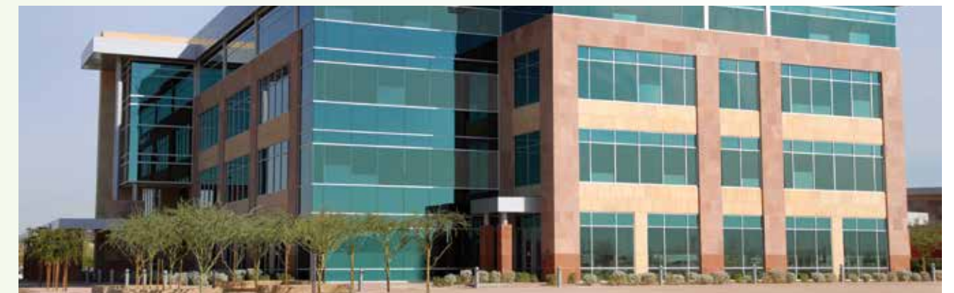
Black backing to streetside